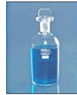
Biochemical Oxygen Demand (BOD) Bottle

BOD, 300 mL, clear, unnumbered, each. 310BTL-BOD ..... $11.55