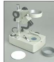
Meiji PBH Stand with Adapter Sleeve

*Access www.spotimaging.com and call us with microscope model and boom stand version to place an order