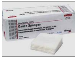
Gauze Pads, 4 x 4", 12-ply, nonsterile Cs/2000, 10 pk/200. 44122000 ..... $69.00