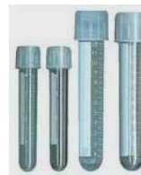
Simport plastic culture tubes with dual-position caps.