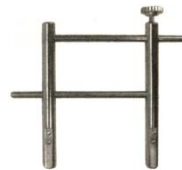
Straight Blade ¼" Offset Pencil Point

Includes handle plus all 3 pairs of tips.