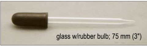
glass w/rubber bulb; 75 mm (3")

Medicine (Eye) Dropper, Pk/12. 97-4301 ..... $3.60