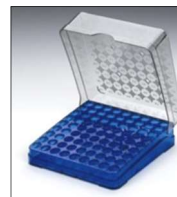
Polycarbonate box stores vials from -196°C to 121°C.