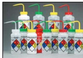
Globally Harmonized System (GHS) wash bottles are vented to prevent solvent drips.