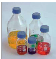
Borosilicate glass bottle; blue PP cap (GL45)