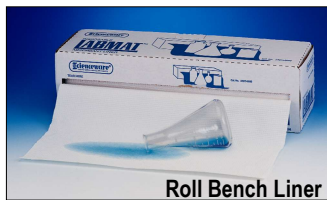
Roll Bench Liner

Protect your bench surface using this 40 mil absorbent liner backed with 0.5 mil polyethylene film.