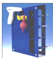
Dimensions: 29 x 8.8 x 40 cm

3-Valve, rubber, black. 207B ..... $14.40 Wheel-Type, Pipette Pump™ Fits Pipets Up To 2 mL, blue. 378970000 ..... $24.35 Fits Pipets Up To 10 mL, green. 378980000 ..... $25.45 Fits Pipets Up To 25 mL, red. 378990000 ..... $35.05 Wheel-Type, Pipette Pump™ II, quick-release ea pk/12 Fits Pipets Up To 2 mL, blue. 379111002 ..... $26.35 299.00 Fits Pipets Up To 10 mL, green. 379111010 ..... $26.35 299.00 Fits Pipets Up To 25 mL, red. 379111025 ..... $35.05 397.00