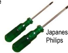
Japanese Style Phillips