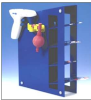
Dimensions: 29 x 8.8 x 40 cm

3-Valve, rubber, black. 207B ..... $14.40 Wheel-Type, Pipette Pump™ Fits Pipets Up To 2 mL, blue. 378970000 ..... $25.00 Fits Pipets Up To 10 mL, green. 378980000 ..... $26.10 Fits Pipets Up To 25 mL, red. 378990000 ..... $35.95 Wheel-Type, Pipette Pump™ II, quick-release ea pk/12 Fits Pipets Up To 2 mL, blue. 379111002 ..... $32.00 345.00 Fits Pipets Up To 10 mL, green. 379111010 ..... $32.00 345.00 Fits Pipets Up To 25 mL, red. 379111025 ..... $42.50 458.00