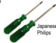
Japanese Style Phillips