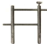
Straight Blade Offset Pencil Point

Includes handle plus all 3 pairs of tips.