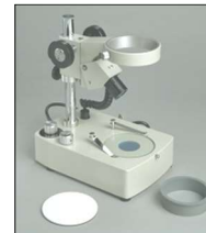
Meiji PBH Stand with Adapter Sleeve

*Access www.spotimaging.com and call us with microscope model and boom stand version to place an order