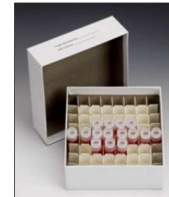
SB2CC-64 Cryogenic Tube Storage Box