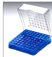
Polycarbonate box stores vials from -196°C to 121°C. Holds vials up to 2 mL; mixed. 13.3 x 13.3 x 5.3 cm