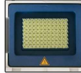
0.2 mL Tubes

Versatile multi-format block holds (96) 0.2 mL tubes/strips, (39) 0.5 mL tubes, or (1) nonskirted 96-well PCR plate. In-situ adapter sold separately. Touchscreen control and height adjustable heated lid. 2-year warranty.