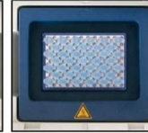
0.5 mL Tubes