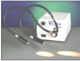
Fiber optic light source with dual gooseneck and two focusing lenses is shown.

Please call regarding availability of items not listed