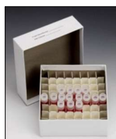
SB2CC-64 Cryogenic Tube Storage Box