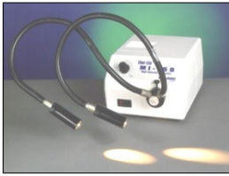
Fiber optic light source with dual gooseneck and two focusing lenses is shown.

Please call regarding availability of items not listed