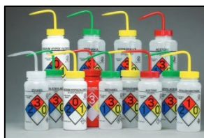
Globally Harmonized System (GHS) wash bottles are vented to prevent solvent drips. Polyethylene bottles (LDPE) with polypropylene (PP) caps.