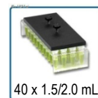
40 x 1.5/2.0 mL