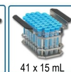
41 x 15 mL

Racks are only included with model B2000-4.