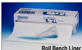
Roll Bench Liner

Protect your bench surface using this 40 mil absorbent liner backed with 0.5 mil polyethylene film.