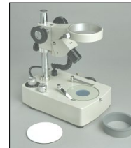
Meiji PBH Stand with Adapter Sleeve

*Access www.spotimaging.com and call us with microscope model and boom stand version to place an order