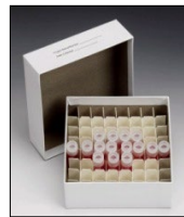
SB2CC-64 Cryogenic Tube Storage Box