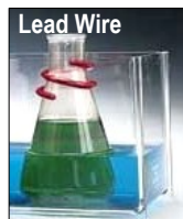
Vinyl-coated lead wire is 300 mm long.