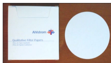
Ahlstrom - Munksjo Filter Paper