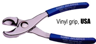
Vinyl grip, USA