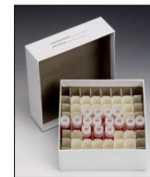
SB2CC-64 Cryogenic Tube Storage Box