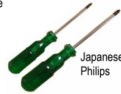
Japanese Style Phillips