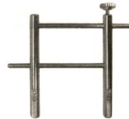
Straight Blade ¼" Offset Pencil Point

Includes handle plus all 3 pairs of tips.