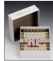
SB2CC-64 Cryogenic Tube Storage Box