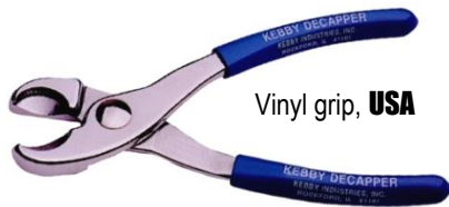
Vinyl grip, USA