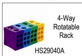
4-Way Rotatable Rack