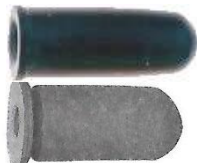
Natural Rubber w/Flange