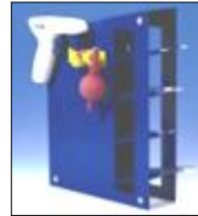
Dimensions: 29 x 8.8 x 40 cm