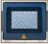
0.5 mL Tubes