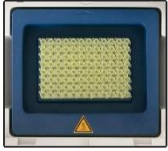
0.2 mL Tubes

Versatile multi-format block holds (96) 0.2 mL tubes/strips, (39) 0.5 mL tubes, or (1) nonskirted 96-well PCR plate. In-situ adapter sold separately. Touchscreen control and height adjustable heated lid. 2-year warranty.