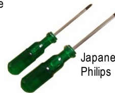
Japanese Style Phillips