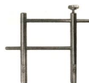
Straight Blade ¼" Offset Pencil Point

Includes handle plus all 3 pairs of tips.