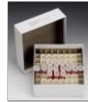
SB2CC-64 Cryogenic Tube Storage Box