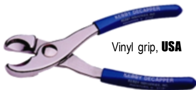
Vinyl grip, USA