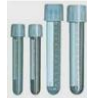
Plastic culture tubes with dual-position caps.