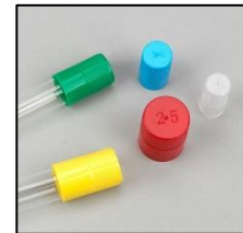
Culture Tube Caps, polypropylene Up to 16 mm Tubes